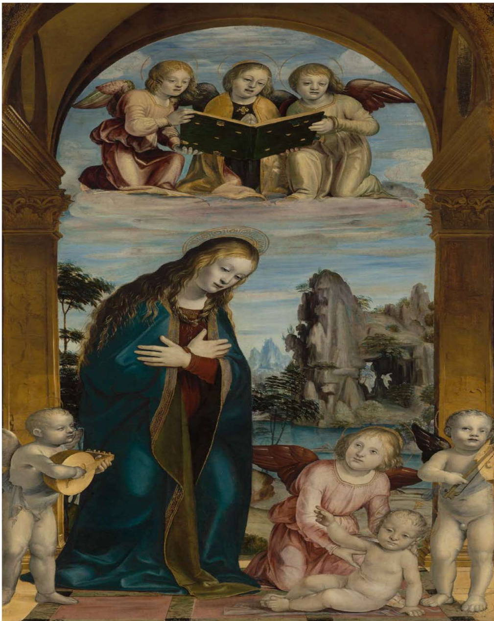
Bernardino Zenale, Madonna Adoring the Child with Musical Angels , c. 1500–1510, oil on panel, The J. Paul Getty Museum, Los Angeles, 71.PB.60